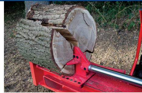
X WEDGE FOR 4 WAY SPLITTING OF LOGS